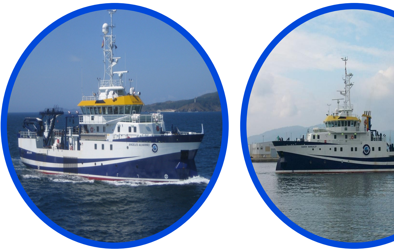
Built in 2011 and 2012, these twins IEO regional vessels carry out their activity around the iberian Peninsula up to the north of the Biscay Bay, through the south of Canary Islands ans the Western Mediterranean Sea