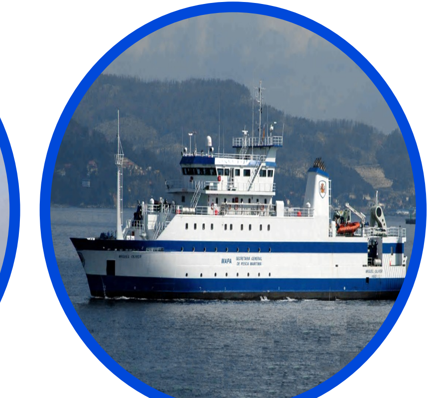
Owned and managed by the Spanish Fisheries Administration (SGP), these vessels carry out surveys to evaluate fishery resources, Oliver has worked along the Iberian Peninsula while Vizconde de Eza performed its ativity on the North Spanish coast as well as NAFO and Porcupine areas.