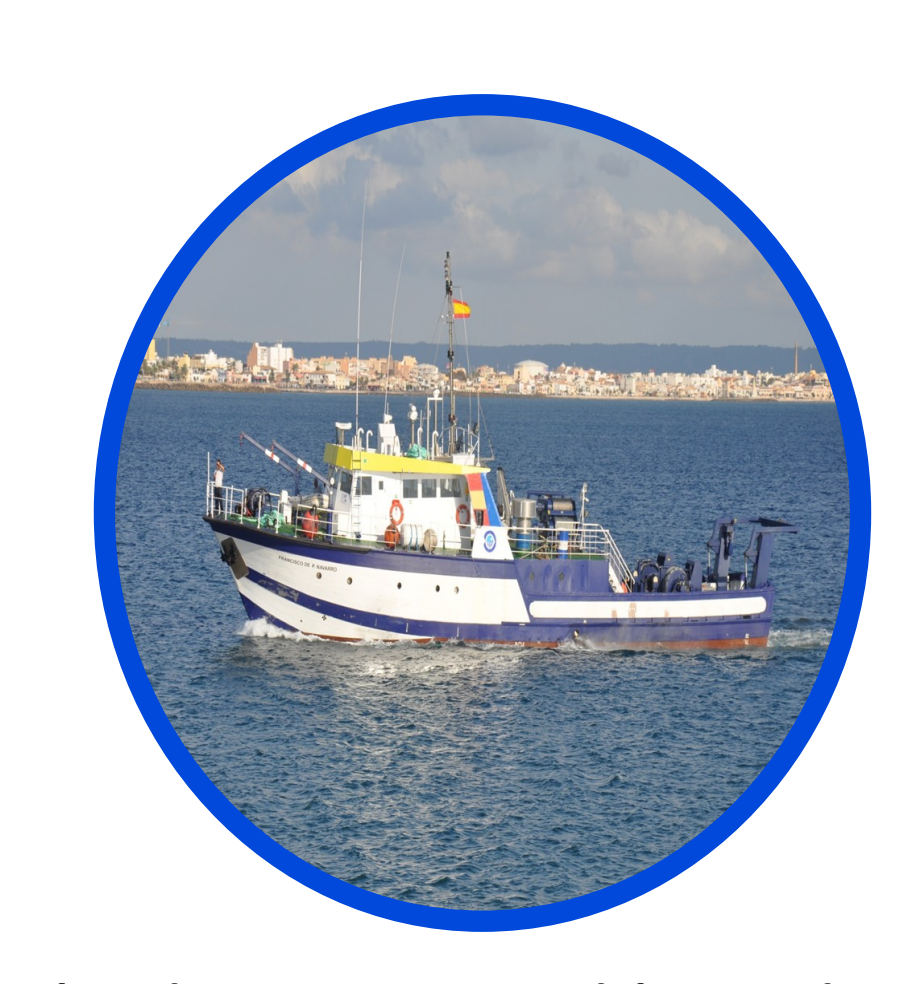
Refurbished in 2013 and based in Palma de Mallorca, Navarro performs coastal and regional surveys along the Spanish Mediterranean Sea.